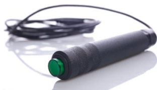
Patient Response Unit